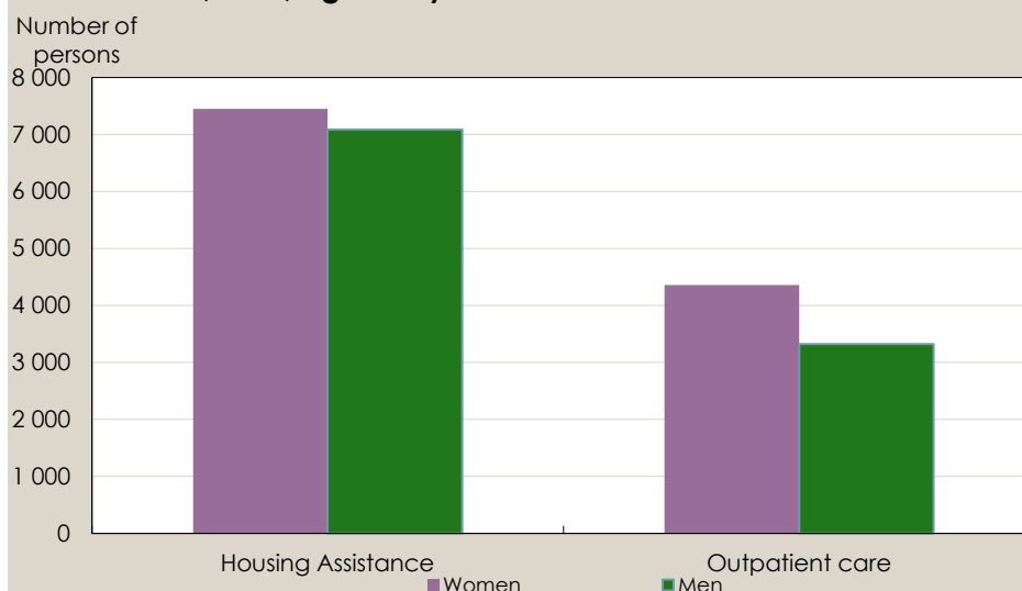
Figure 3. Care for Persons with Housing Assistance and Family Support November 1, 2017, aged 21 year and older. Women and men.